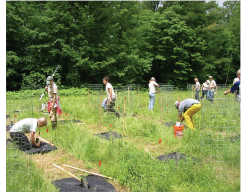
Crew of USFS, TACF, UVM and Student Conservation Association (SCA) employees planting American chestnuts on the Green Mountain National Forest as part of collaborative research.

removal, and a no-removal, closed canopy setting). By replicating plantings over silvicultural treatments we will be able to statistically assess how genetics and the environment (over-story retention) influence the growth and cold tolerance of planted stock. Seedling growth and signs of winter injury (terminal shoot dieback) will be assessed for several years before seedlings are large enough to be used for laboratory tests of cold tolerance. This study will increase the understanding of important details pertinent to the restoration of this species to the Northeast, so that the timber, carbon storage and nut production benefits provided by American chestnut may once again be realized by the people and wildlife of the region.