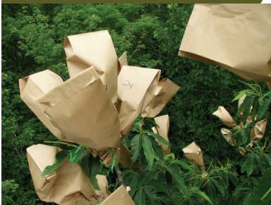
Bags over the female chestnut flowers keep blight-resistant pollen in and unwanted pollen out.